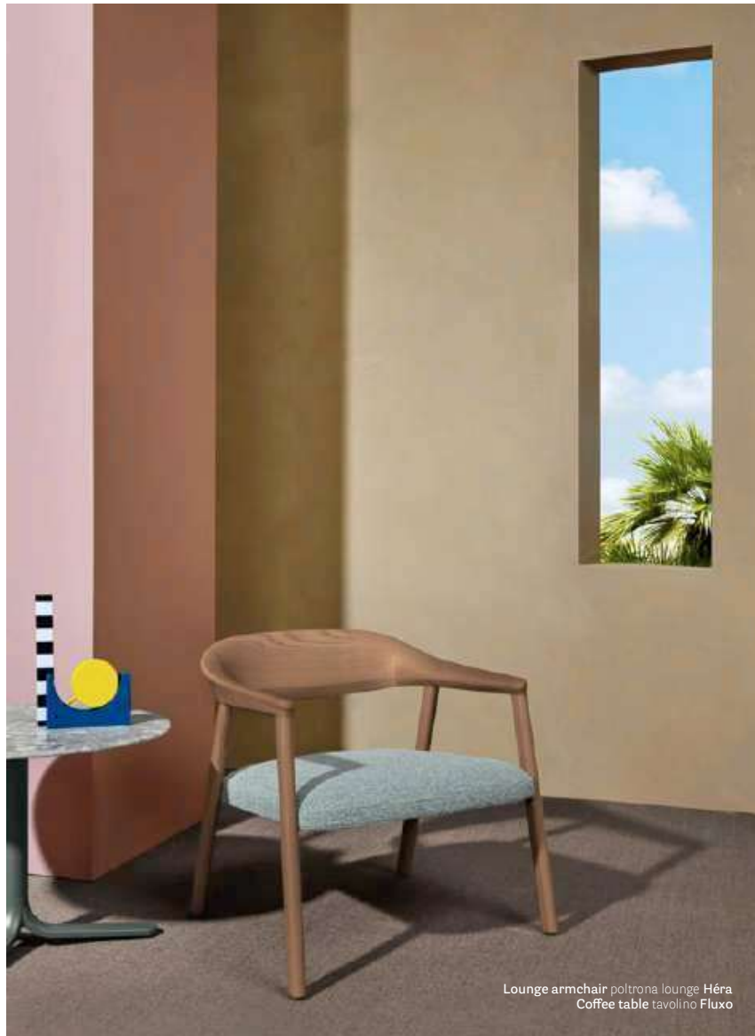
Lounge armchair poltrona lounge Héra Coffee table tavolino Fluxo