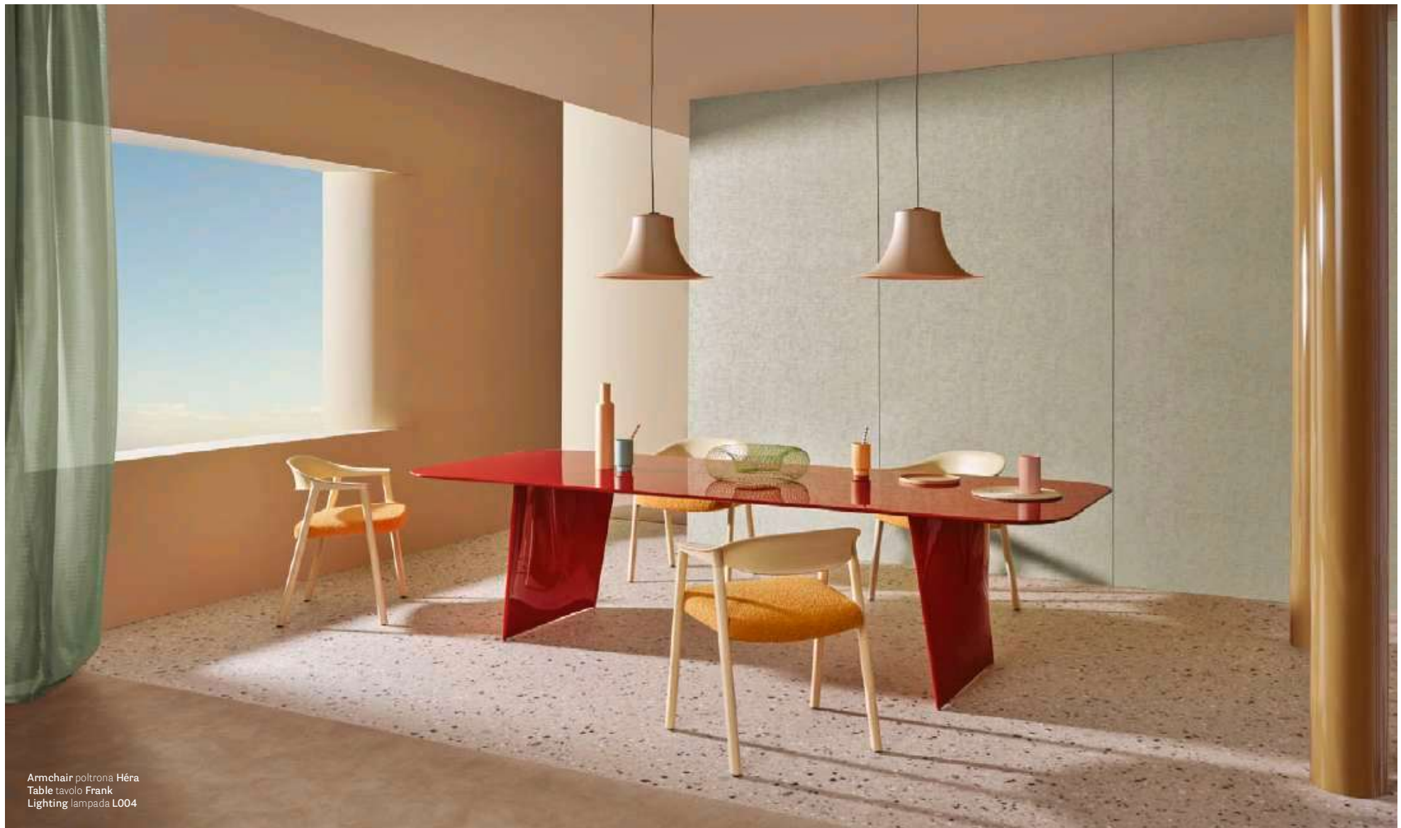
Armchair poltrona Héra Table tavolo Frank Lighting lampada L004