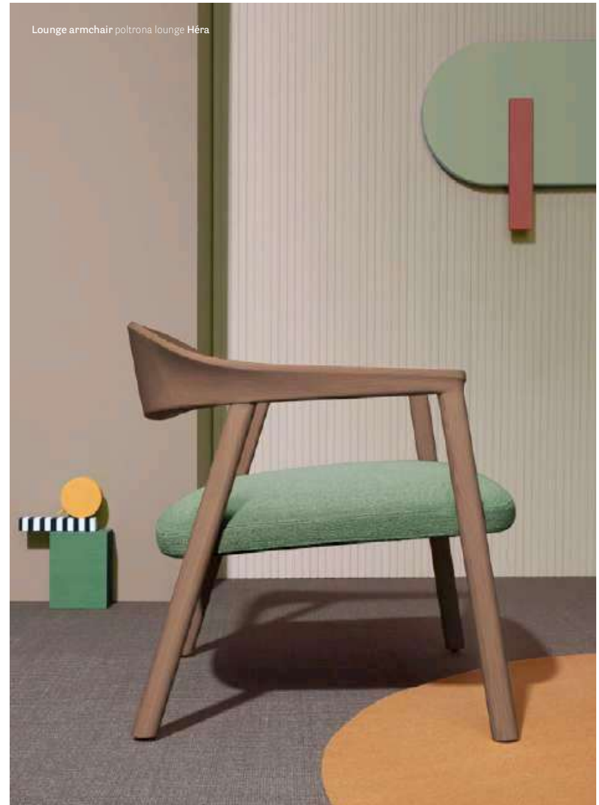
Lounge armchair poltrona lounge Héra